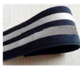
■ Woven Elastic