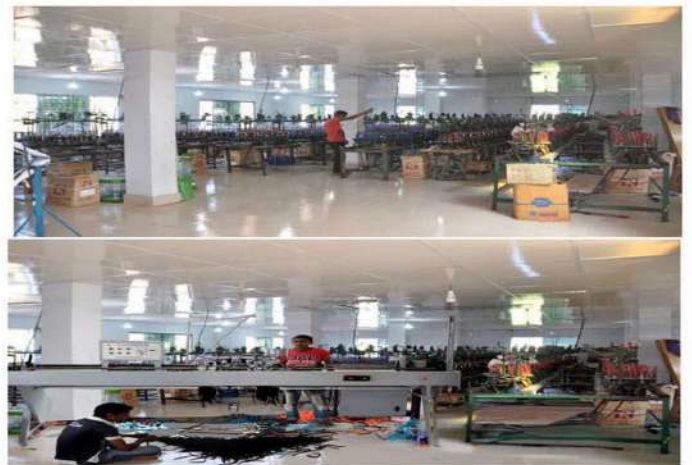
DROW CORD/DRAWSTRING SECTION