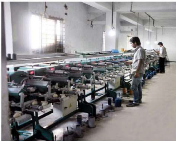
SEWING THREAD SECTION