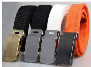
■ Woven Belt