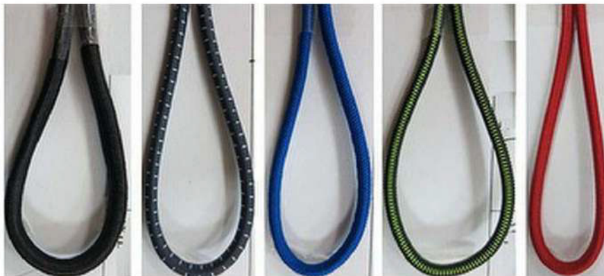
■ Draw Cord