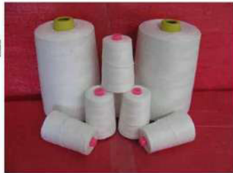
■ Sewing Thread